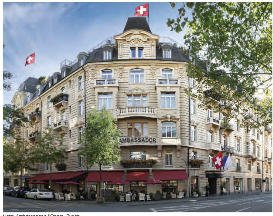
Hotel Ambassador a l'Opera, Zurich

Set on the banks of Lake Zurich, the Hotel Baur au Lac is equipped with a Michelinstarred restaurant, extensive tranquil parkland, and a rich, warm interior design. Guests can enjoy the beauty of the lake from the promenade or from a boat cruise, before returning to the hotel to enjoy the serene gardens, the chic luxurious indoor spaces, and the circular restaurant that juts out across the water. read more