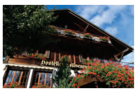
Hotel Alpenrose, Schoenried