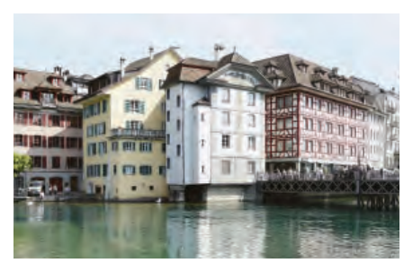
Hotel Wilden Mann, Lucerne

This stylish hotel in Montreux is a stunning palatial property with beautiful views of Lake Geneva. Enjoy an evening here relaxing at the bar and taking in the stunning views from the vast terrace. Accommodation is in elegant rooms appointed in minimalist style with classical touches. Opt for a lake view room here for an extra luxurious touch.