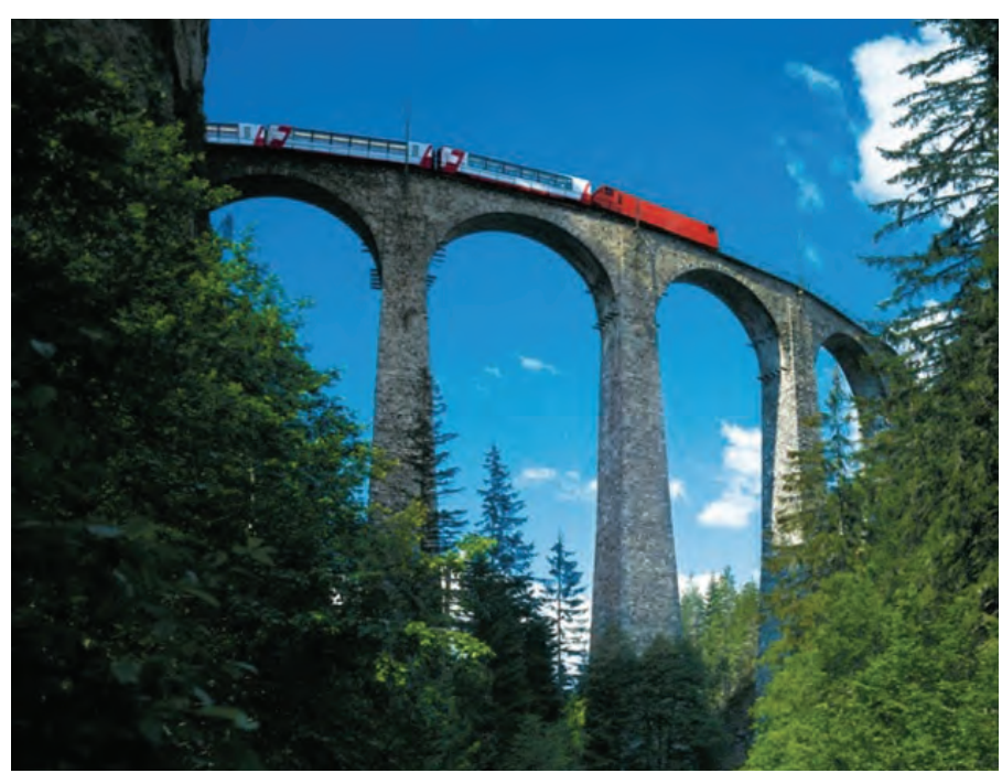
The Bernina Express

If you are arriving from or returning to the UK by rail, we would recommend spending an extra night in Zurich at the beginning or end of your tour. It is also possible to add additional nights in any of the destinations mentioned.