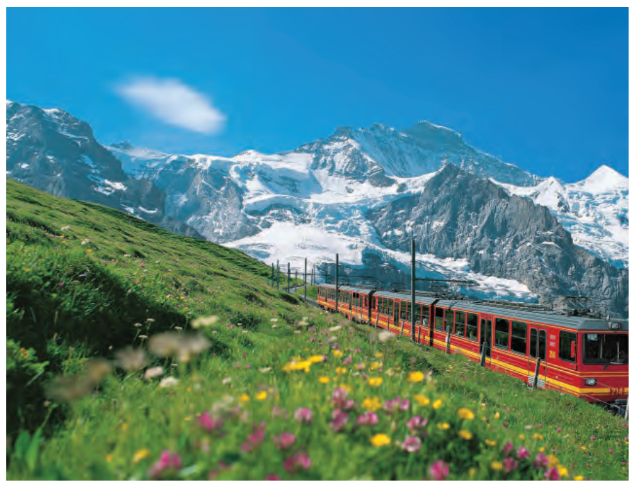
In the Bernese Oberland

Today you board one of the distinctive carriages of the Glacier Express to Andermatt, where you change trains on your way to Lugano. This short stretch of the Glacier Express takes you first through the enchanting village of St Niklaus, defined by its rustic chalet houses with peaked roofs, and then onto Brig, where the 17th century Stockalper Castle stands proudly at the centre of the Old Town, crowned by unusual onion domes. The Glacier Express then takes you through the Furka Tunnel of the Furka Steam Railway, past the ice caves of the Rhone Glacier, and over the