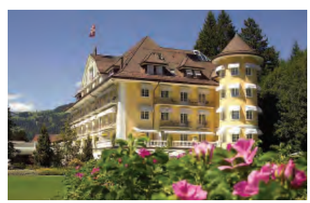
Le Grand Bellevue, Gstaad