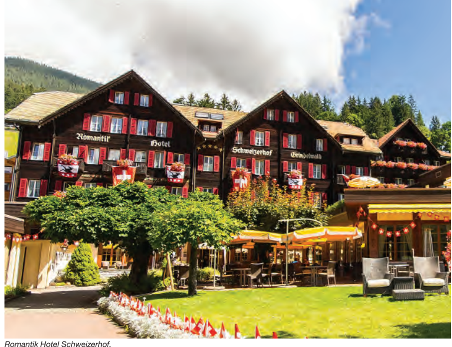
Romantik Hotel Schweizerhof

This attractive, traditional hotel has an abundance of authentic Swiss character, from the dark wood chalet exterior, to the rich, cosy colours of the interiors. A 'stubli' style restaurant serves guests a range of Swiss specialities, a comfortable lounge and a picturesque garden provide hours of relaxation, and the idyllic spa offers a place to relax after a day exploring the mountains of the Bernese Oberland.