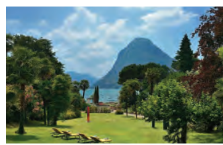
Grand Hotel Villa Castagnola, Lugano