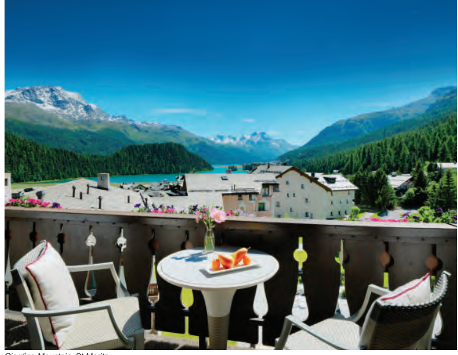
Giardino Mountain, St Moritz

Built around traditional Swiss elements, this hotel provides simplistic luxuries in an area rich with gourmet restaurants. Inside the hotel, guests experience cosy, warm rooms, sleek, monochrome suites, and an unrelenting attention to detail.