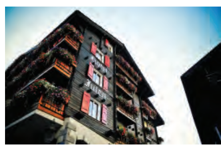
Romantik Hotel Julen. Zermatt

This timeless townhouse is situated within easy reach of Chur's famous Old Town. White shutters frame the tall windows, and the combination of pink and white stucco gives this building a very pretty aspect. Guests here are treated to a real taste of authentic Switzerland, in the light, yet rustic bedrooms, and in the 'stubli' restaurant, which serves a range of Alpine delicacies.